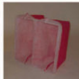
Pocket Cube Filter