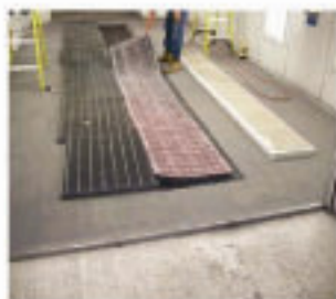
Booth Floor With Dirty Filters

The efficiency of the spray booth operation, as well as the resulting quality of the sprayed finish is affected by both the intake and exhaust filters (also known as paint overspray arrestors). When the intake and paint arrestor filters are well maintained, the air flows evenly through the spray chamber and around the part or vehicle surface, picking up the overspray and volatiles and promptly removing them from the area.